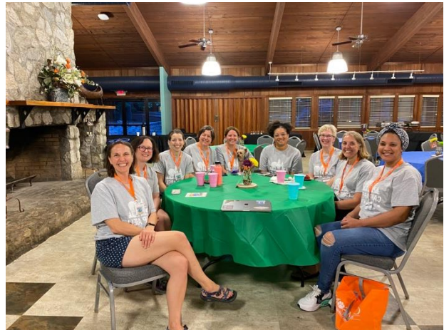
Sandra K. Abell Institute for Doctoral Students (SKAIDS)

This includes improving helping teachers to better reach children to: